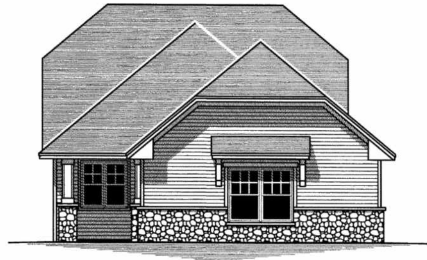
FRONT ELEVATION 'II'