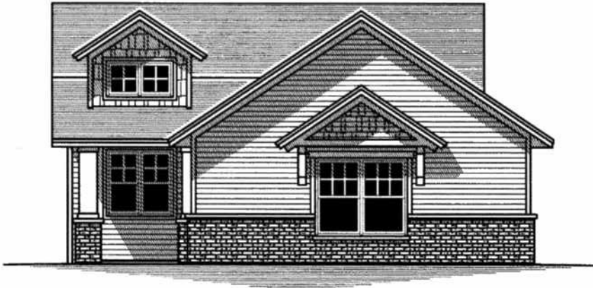
FRONT ELEVATION 'I'